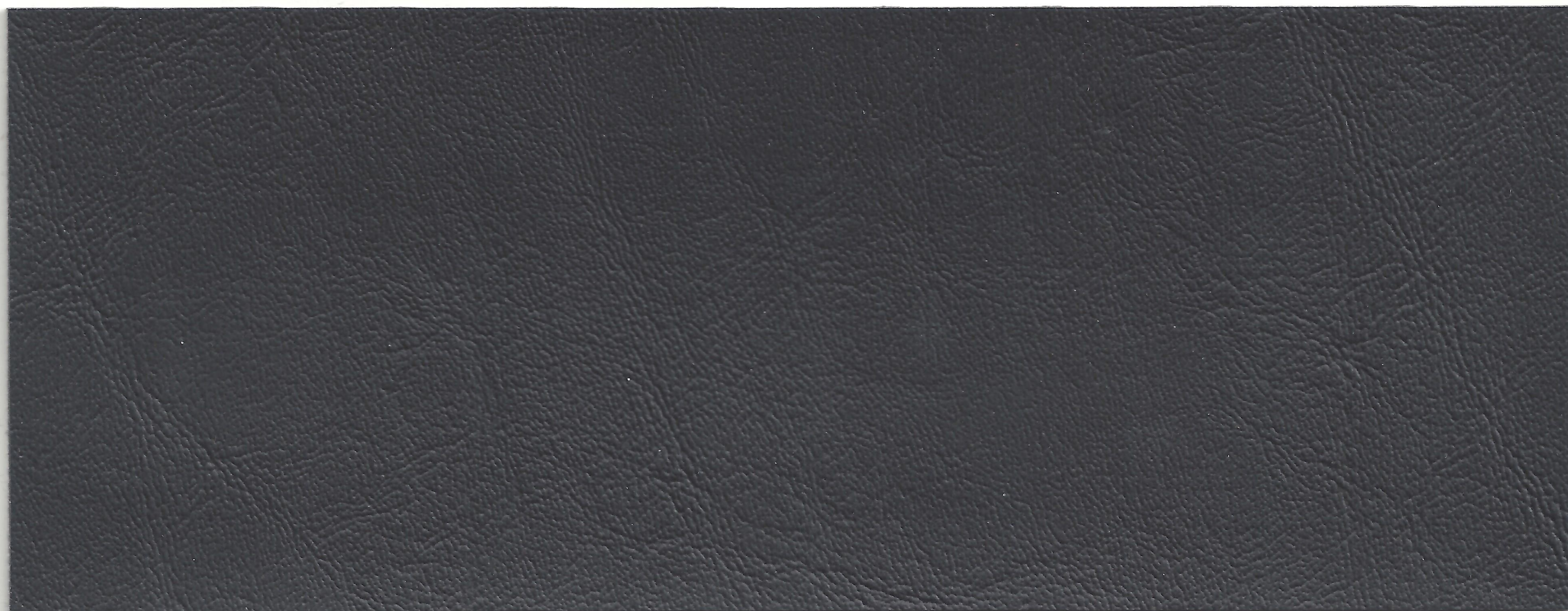
Wallaby Black FL403