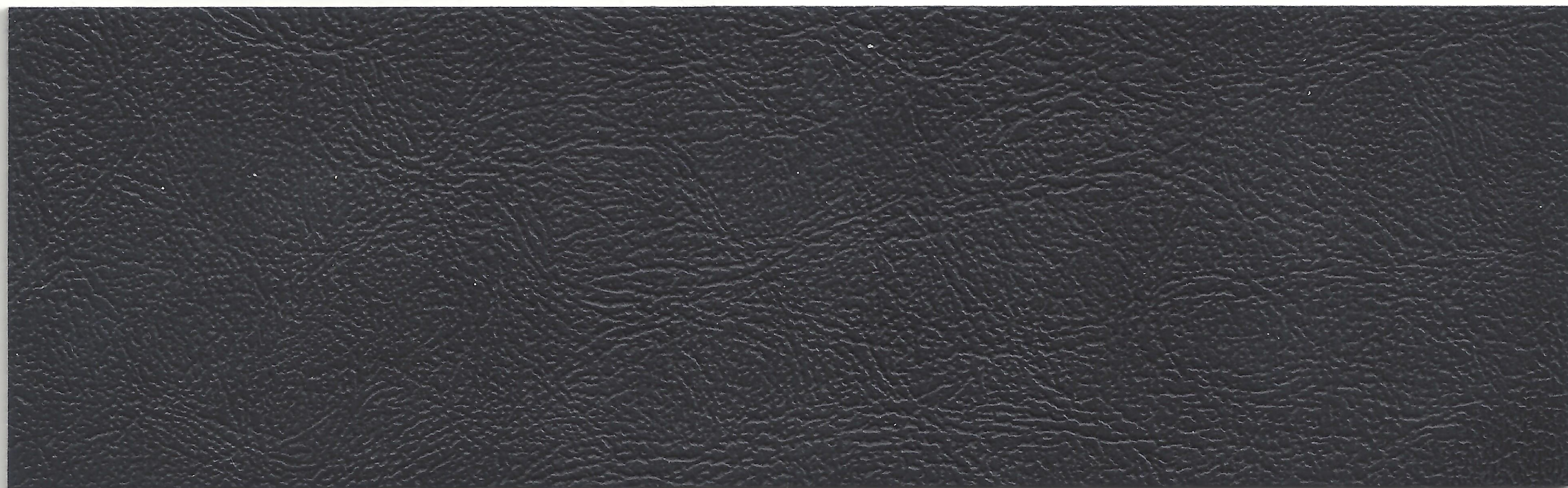
Sierra Black FL404