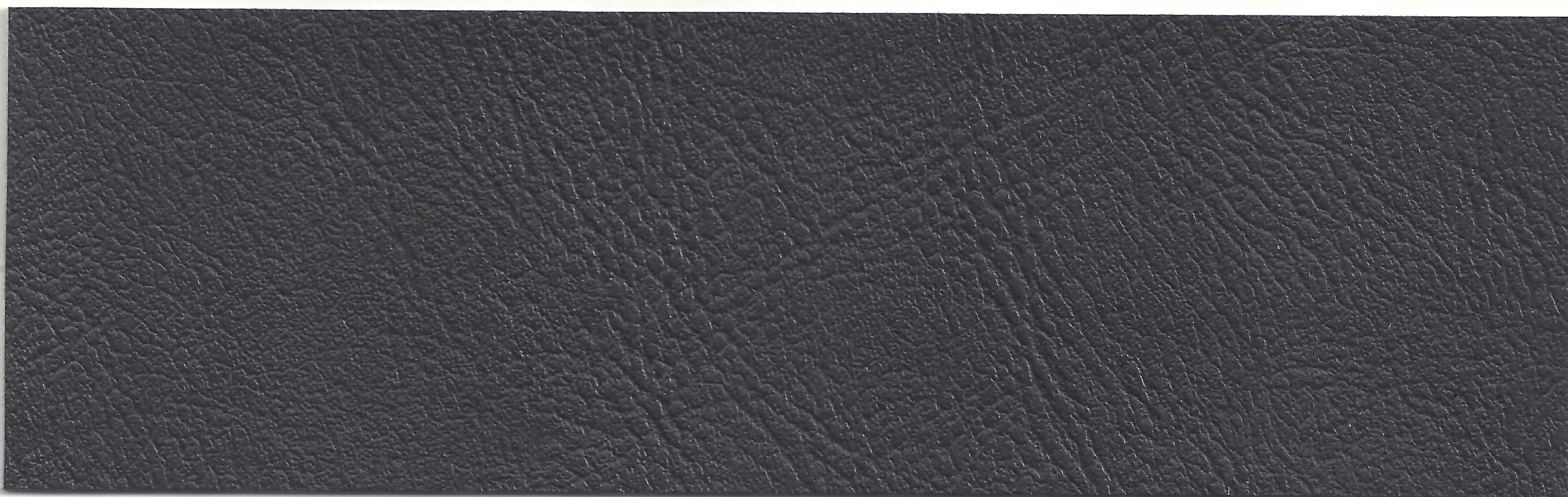
Madrid Black FL400