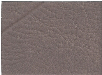
Antique Taupe CTP-511