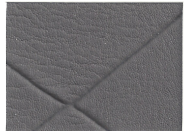
Trolley Grey CTP-510