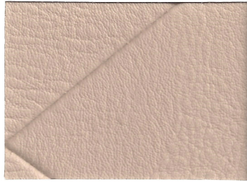
Sand Dollar CTP-903