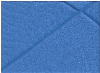
Bruin Blue CTP-902