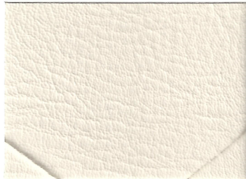
Almond Cream CTP-904