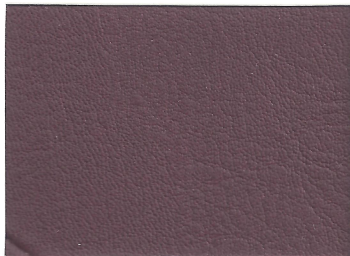
Dark Cherry CTP-512