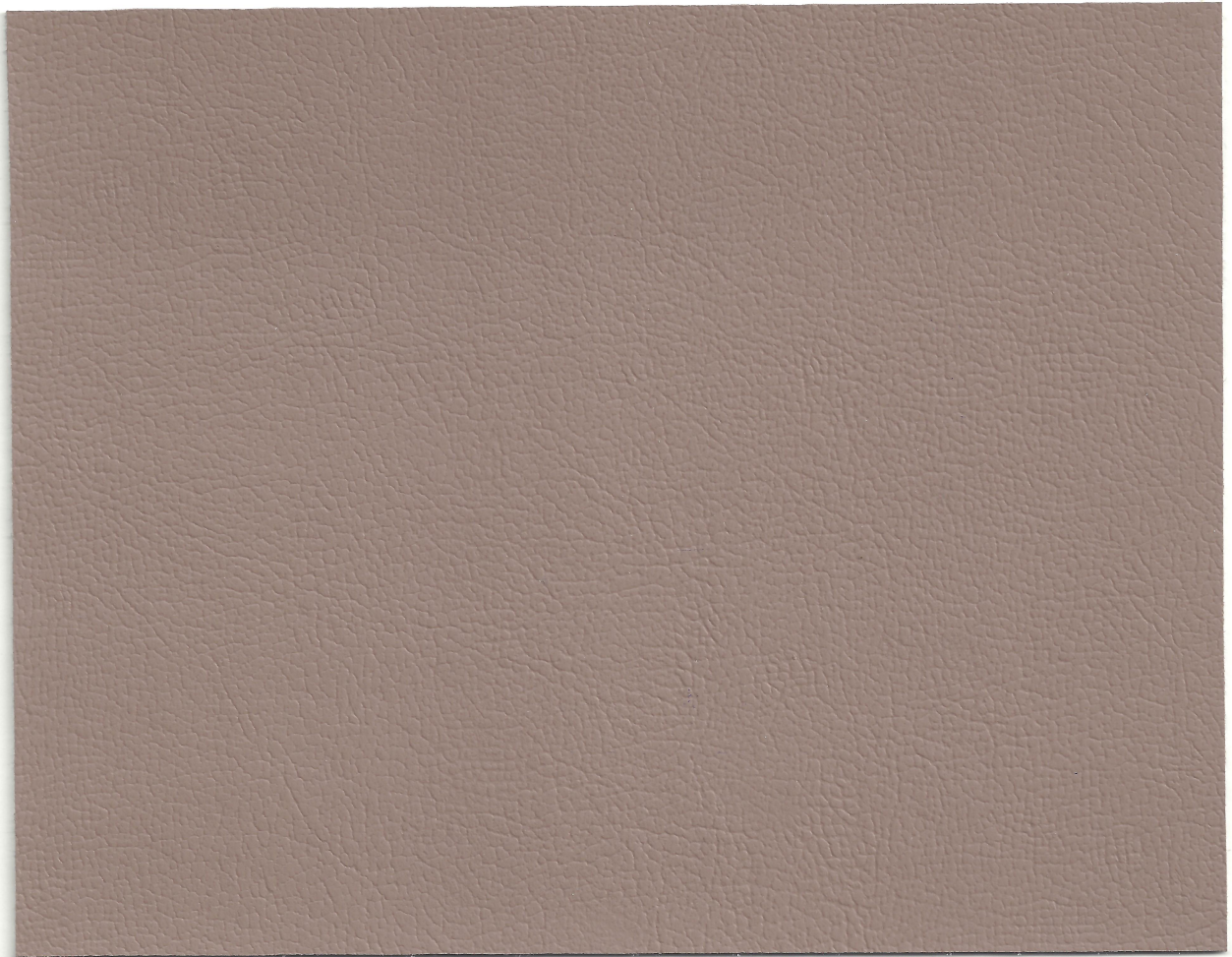
Md Prairie Tan GGS-7118