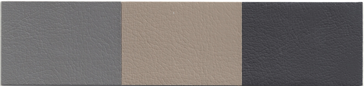
Md Flint GGS-7357-A