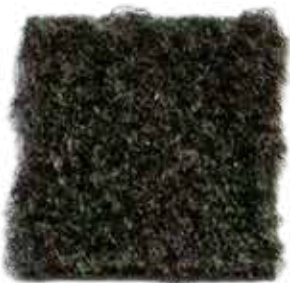
CA5727 Charcoal 8'6"