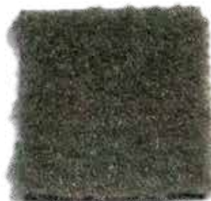
CA5745 Smoke 8'6"