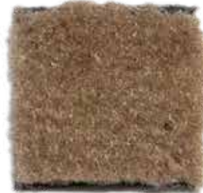
CA5704 Driftwood 8'6"