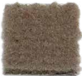
CA5717 Light Beige 8'6"