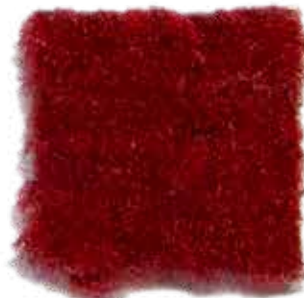
CA5718 Sunset 8'6"