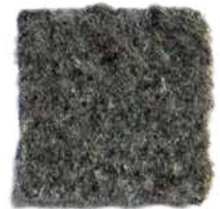
CA5710 Marble Grey 8'6"