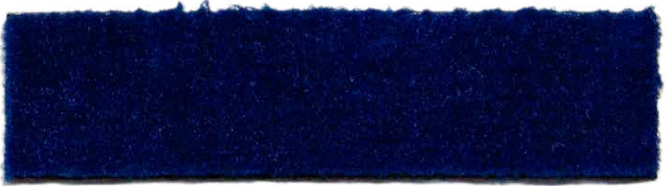
CA5801 Royal Blue 8'6"