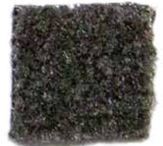
CA5650 Metallic Grey 6'