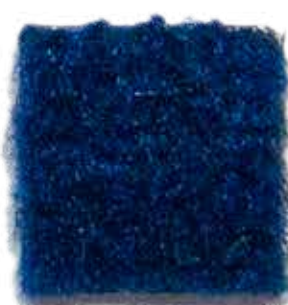
CA5719 Indigo 8'6"