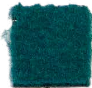
CA5762 Teal 8'6"