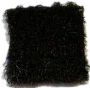
CA5825 Black 8'6"