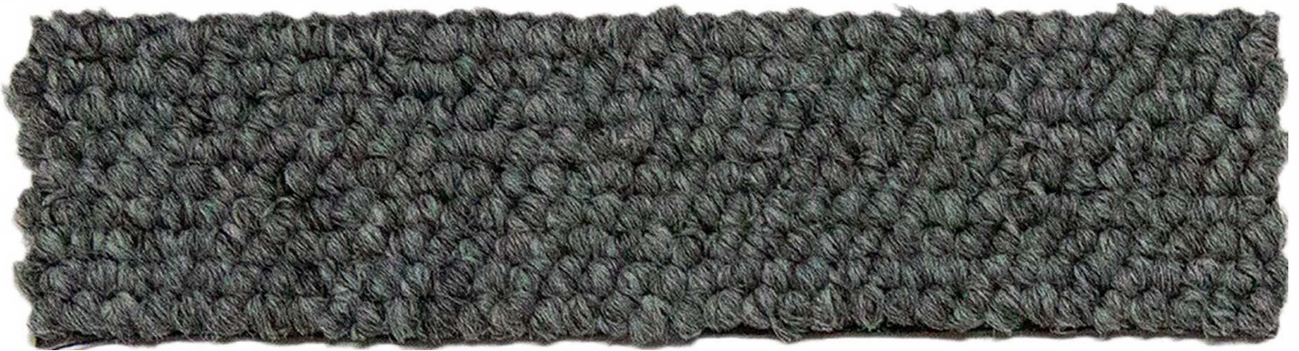
CA5510 Grey 8'6"