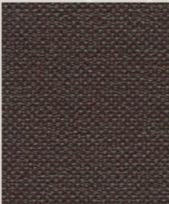
779 Chocolate Brown (13oz) 779-LT Chocolate Brown (8oz)