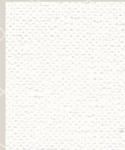
765 White (13oz) 765-LT White (8oz)