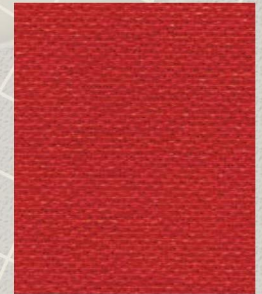
736 Red (13oz) †* 736-LT Red (8oz) †*