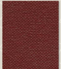
776 Burgundy* (13oz) 776-LT Burgundy* (8oz)