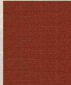
743 Terra Cotta (13oz) 743-LT Terra Cotta (8oz)