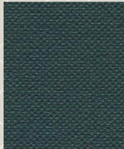
740 Hunter Green* (13oz) 740-LT Hunter Green*(8oz)