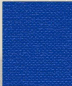
731 Ocean Blue (13oz) 731-LT Ocean Blue (8oz)