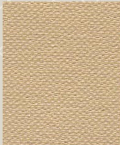
719 Tan (13oz) 719-LT Tan (8oz)