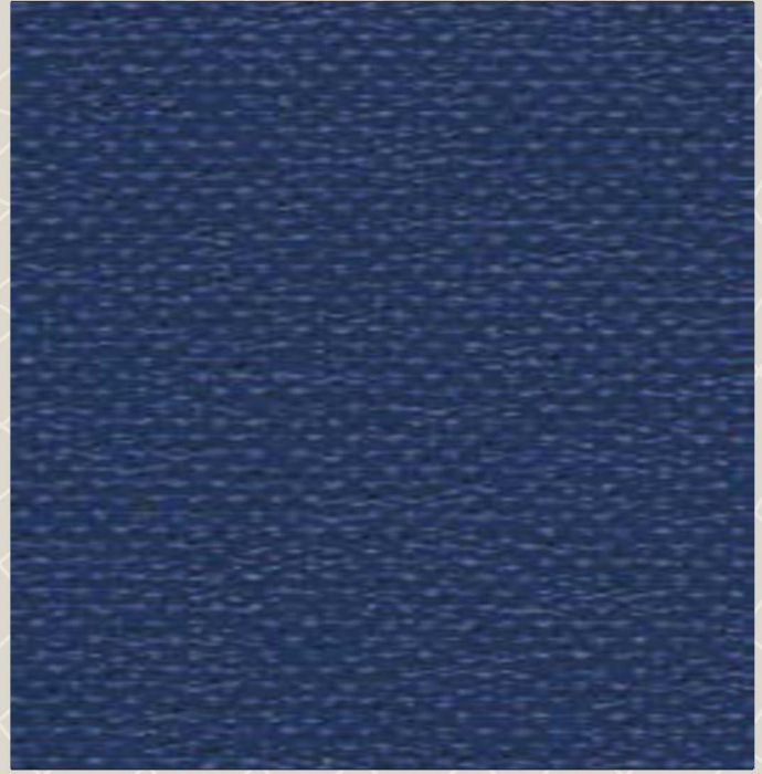
710-LT Royal Blue* (8 oz) 710 Royal Blue* (13 oz)