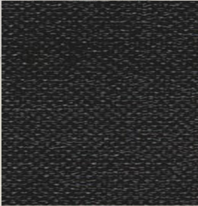
751 Raven Black (13 oz) 751-LT Raven Black (8 oz)

8 and 13 ounce Acrylic Coated Flame Retardant Polyester