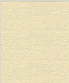
707 Ivory (13oz) 707-LT Ivory (8oz)