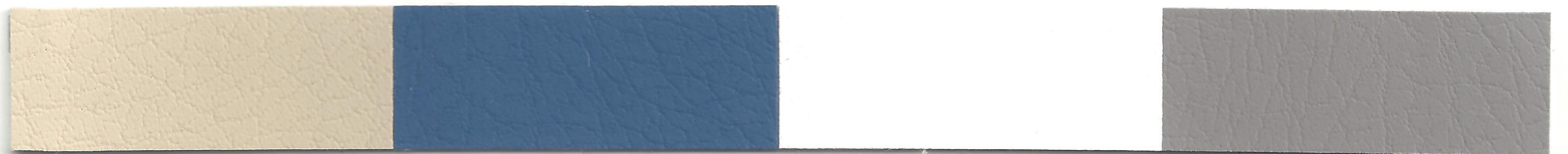
Smokey Quartz VAQ-1044