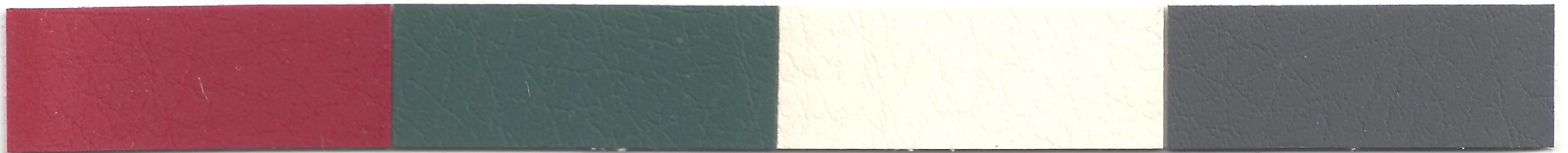
Apple Jack VAQ-1000