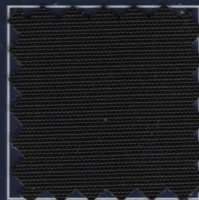
BLACK X SG355