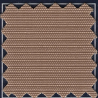
TOAST X SG348