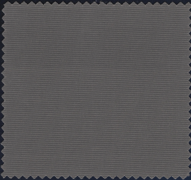
LIGHT CHARCOAL X 3G334