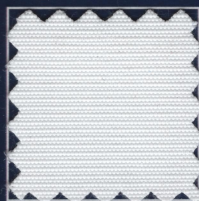
WHITE X SG371